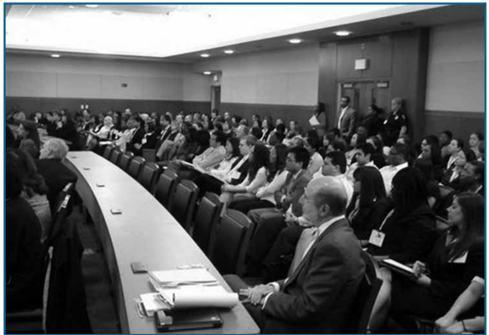
FAMU students and members of the ABA Law Student Division filled the courtroom for live oral arguments in front of the Fifth District Court of Appeals for Florida.

Generally, we find that our students gain a level of insight into the appellate process that they could get only if they went to the court. This event brings