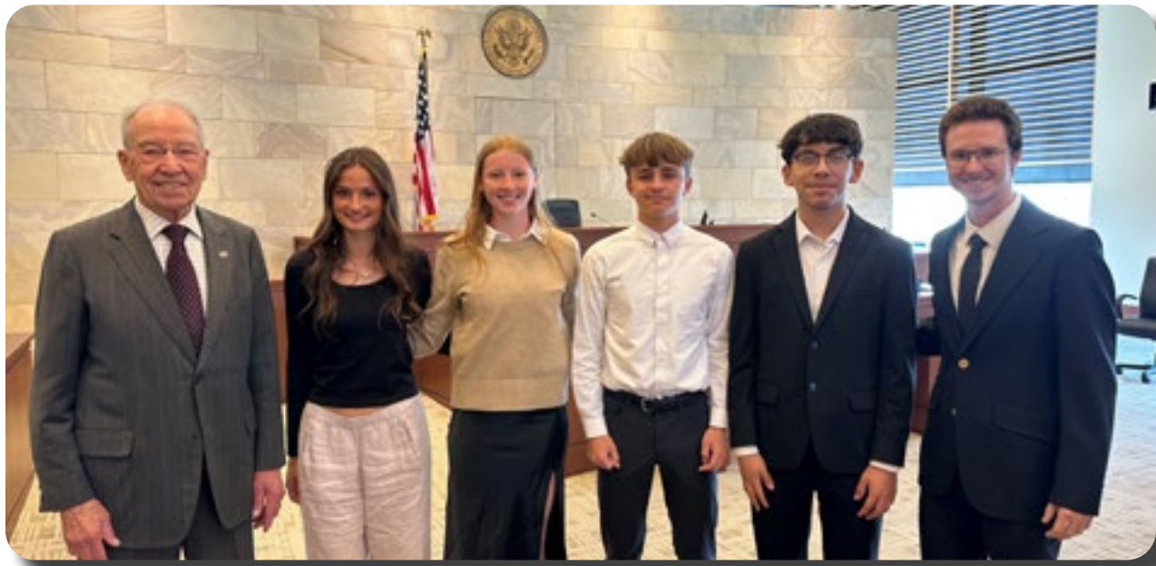
Grassley hosts his sixth Federal Judiciary Youth Summit, giving eastern Iowa students a glimpse into the judicial branch.

Grassley also teamed up with House Judiciary Committee Chairman Jim Jordan (R-Ohio) to probe federal judges who provided anonymous statements to the press smearing the Supreme Court. The chairmen wrote to Supreme Court Chief Justice John Roberts, urging him to address the inappropriate comments and noting that judges' inflammatory comments cast doubt on the judiciary and may even violate judicial ethical obligations .