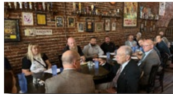
Grassley discusses no tax on tips in Pottawattamie County.