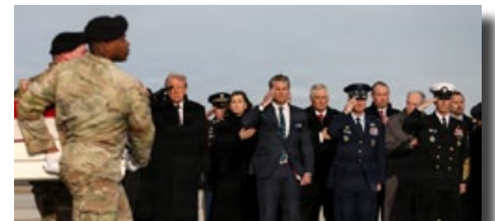
Grassley attends the dignified transfer of remains for two fallen Iowa National Guard members at Dover Air Force Base.

In an effort to root out wrongdoing and improper influence, he has also conducted oversight of nonprofits and educational institutions in the United States that accept CCP-backed funding.