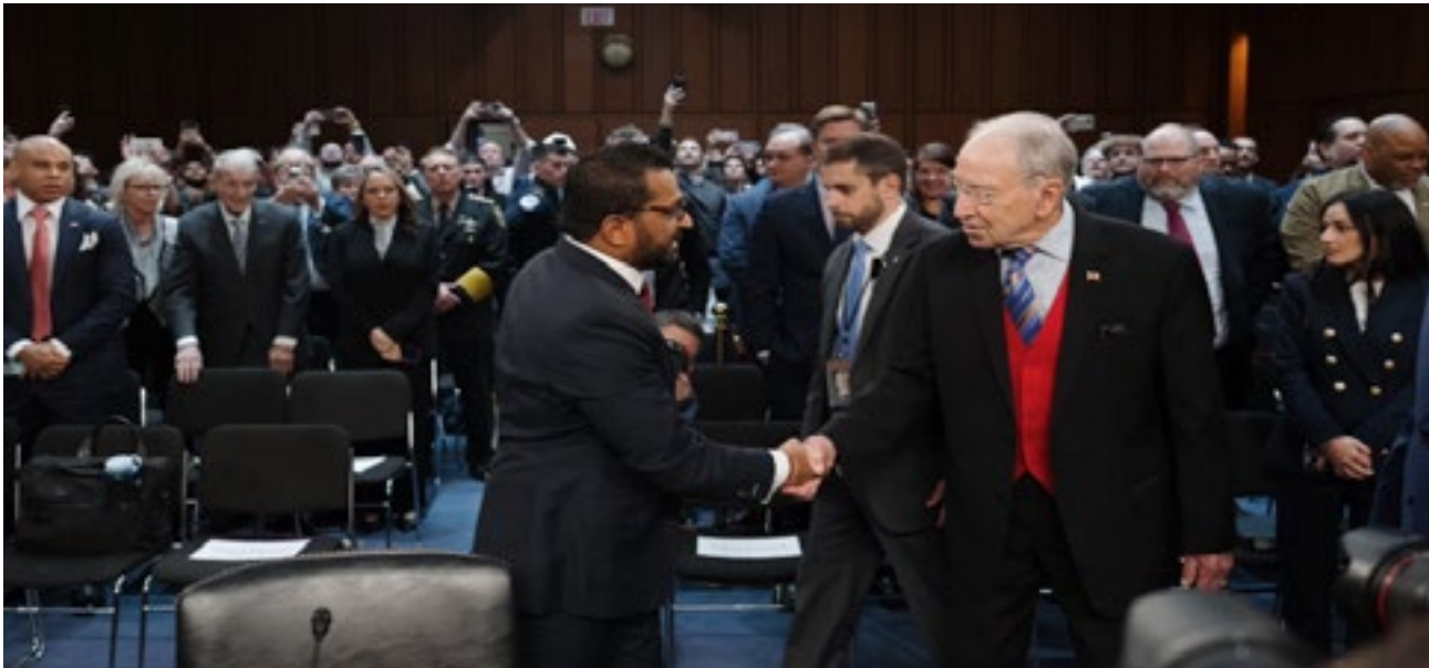
Grassley welcomes FBI Director Kash Patel to the Senate Judiciary Committee.

Under Chairman Grassley's leadership, the Judiciary Committee in 2025 advanced 84 of President Trump's executive and judicial nominees, including Attorney General Pam Bondi , Deputy Attorney General Todd Blanche , FBI Director Kash Patel , six circuit court judges and 24 district court judges. The Committee also reported out 36 U.S. attorney nominees – outpacing the number advanced in the Biden administration's first year. In 2026, the Judiciary Committee will continue to efficiently advance highly qualified nominees to serve the American people and faithfully uphold the rule of law.