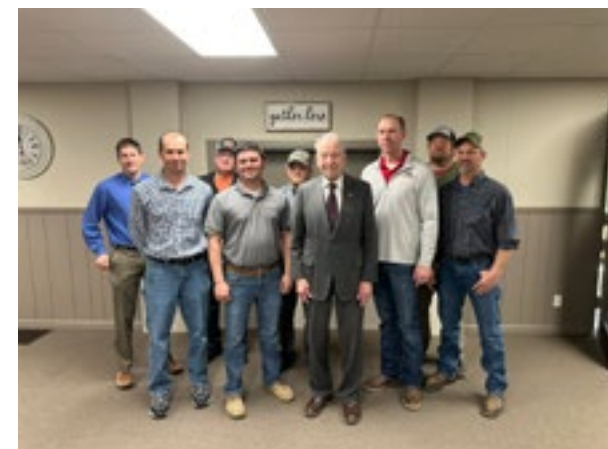
Grassley holds a Q&A with members of the Jones County Farm Bureau in Anamosa.

The White House announced bridge payments in December to help farmers survive the financial headwinds through no fault of their own, from high input costs to falling commodity prices and uncertain export markets. While the Trump administration continues working to fix trade imbalances and hold China's feet to the fire to buy U.S. soybeans , Grassley continues pressing the White House to get behind year-round, nationwide E15 that would add billions to the farm economy.