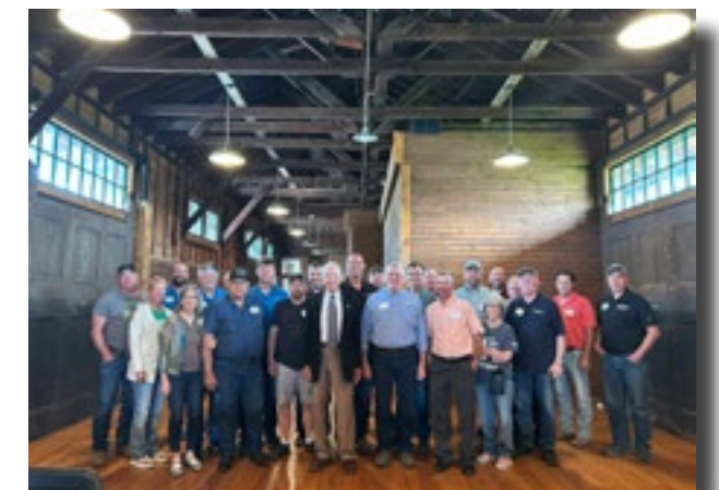
Grassley holds a Q&A with members of the Iowa Corn Growers Association in Lucas County.