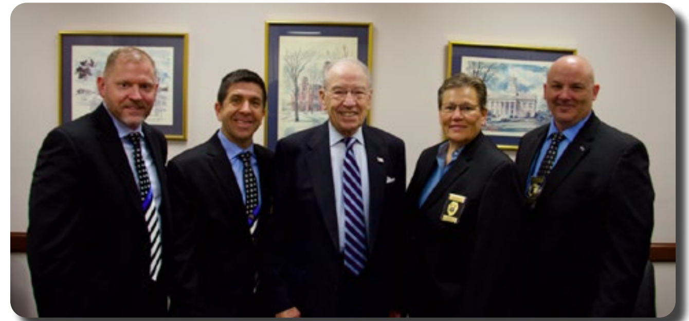
Grassley meets with the Iowa State Police Association in Washington.

Grassley also secured historic investments for law enforcement officers as part of the Working Family Tax Cuts law. Grassley's provisions increased funding for training centers, the Bureau of Prisons and programs that support local police departments. Law enforcement organizations nationwide supported his efforts, noting the new funding would supercharge their work to safeguard national security and public safety.