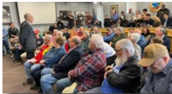
Grassley holds Lee County town meeting.

In August, Grassley met with the Iowa Restaurant Association, the Iowa Hotel and Lodging Association and the Iowa Latino Hospitality Council in Council Bluffs. Employers shared how thrilled their workers are to keep more take-home pay, with no tax on tips and no tax on overtime policies thanks to the historic law President Trump signed in July. From soybean farmers in Corning to health care professionals in Madison County , to factory workers in Dickinson County , Grassley celebrated Iowa’s skilled workforce and heard what matters most to families across the state.