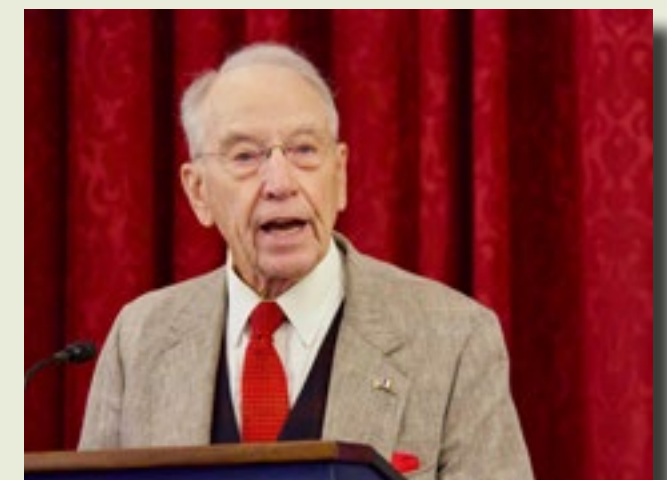
Grassley speaks at the annual National Whistleblower Day event.

As the co-founder and co-chair of the Senate Whistleblower Protection Caucus , Grassley works tirelessly to empower brave truth-tellers and shield them from unlawful retaliation. In the past year, he's successfully restored the careers of at least 15 whistleblowers at three separate federal agencies.