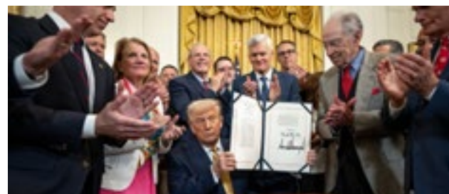
Grassley attends the signing ceremony of the HALT Fentanyl Act.

For decades, cartels exploited a legal loophole to traffic deadly drugs into American communities. Thanks to Grassley's Halt All Lethal Trafficking (HALT) of Fentanyl Act , that loophole no longer exists. The HALT Fentanyl Act , which was signed into law this summer, permanently classified fentanyl-related substances as a highly lethal drug with no legitimate use. Anyone involved in pedaling these poisons will face harsh consequences.