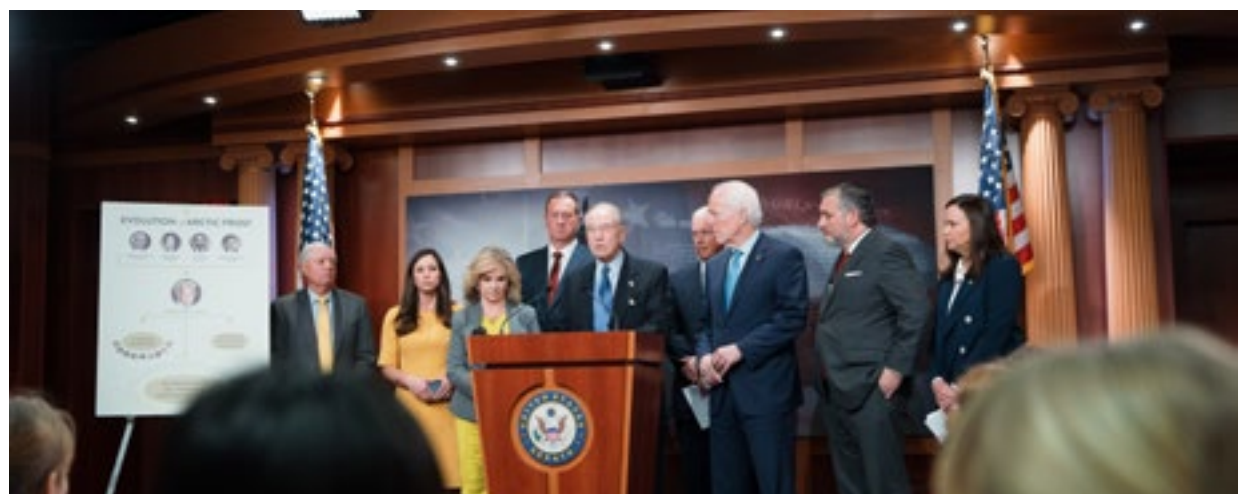
Grassley holds a press conference on shocking Arctic Frost findings.

Arctic Frost was a runaway train that targeted the entire Republican political apparatus. Smith's invasive actions raise serious constitutional and legal questions, and those involved in Arctic Frost must answer for their actions. That's why Grassley is leading the charge in Congress to expose everything behind this outrageous act of government weaponization. He plans to hold a series of hearings to do exactly that in 2026.